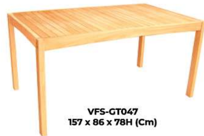
VFS-GT047 157 x 86 x 78H (Cm)