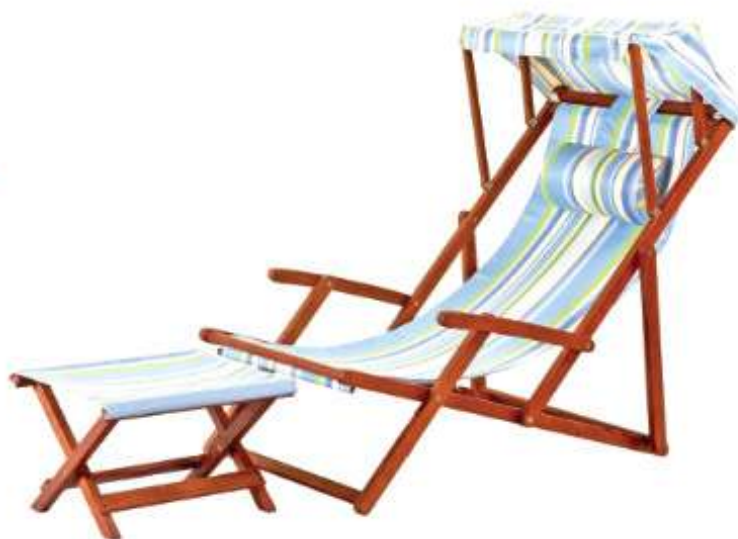
VFS-GC07TB 102 x 67 x 98H (Cm)