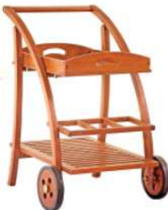
VFS-GO02LG 65 X 52 X 79H (Cm)