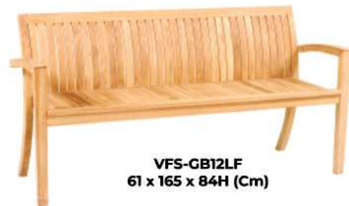
VFS-GB12LF 61 x 165 x 84H (Cm)