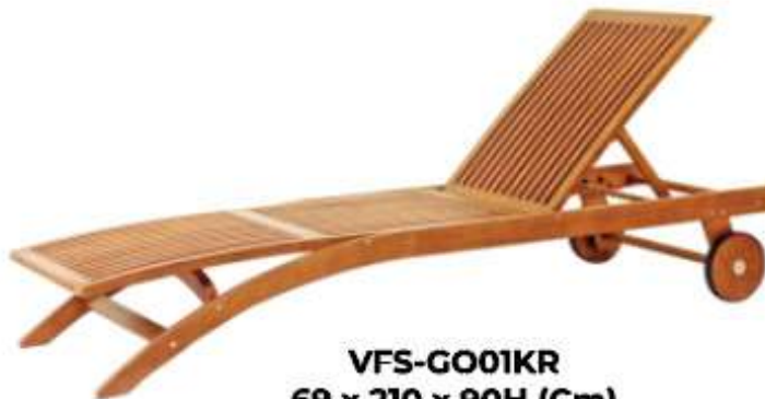
VFS-GO01KR 69 x 210 x 90H (Cm)