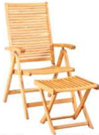
VFS-GC03CL 69 x 61 x 111H (Cm)