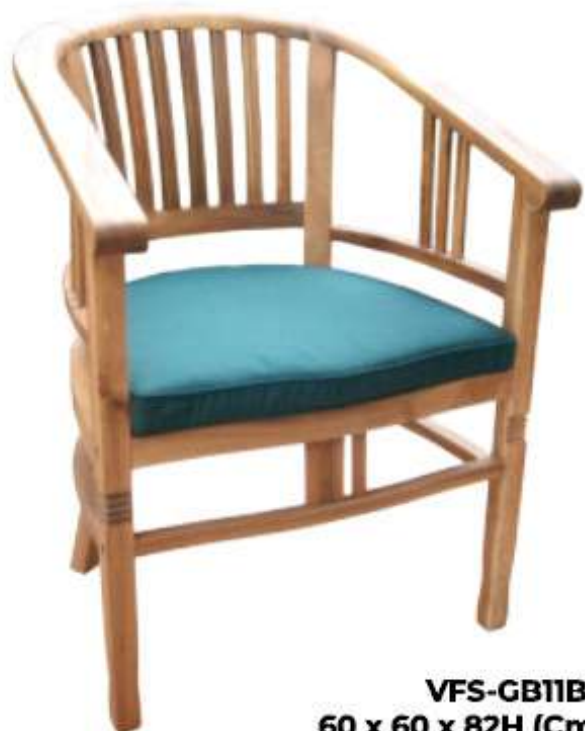
VFS-GB11BT 60 x 60 x 82H (Cm)