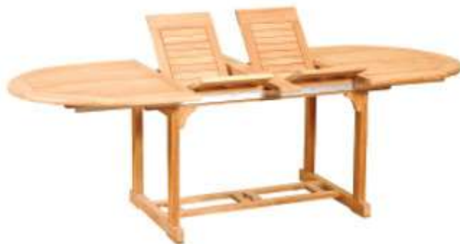
VFS-GT28E0 230/195/160 x 100 x 74H (Cm)