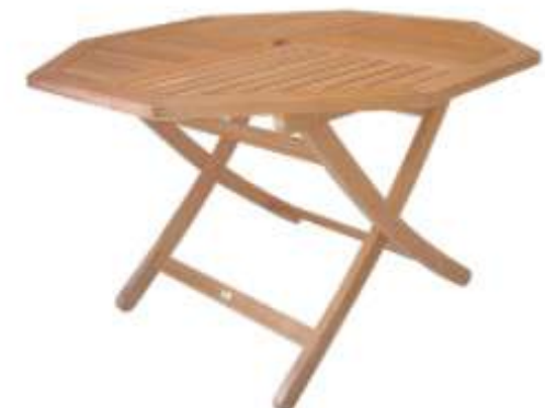
VFS-GT032B 120 x 120 x 74H (Cm)