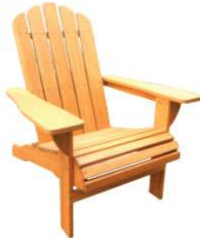
VFS-GO01AD 77 x 93.5 x 95.5H (Cm)