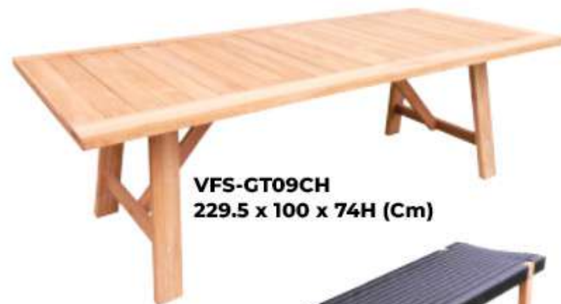
VFS-GT09CH 229.5 x 100 x 74H (Cm)