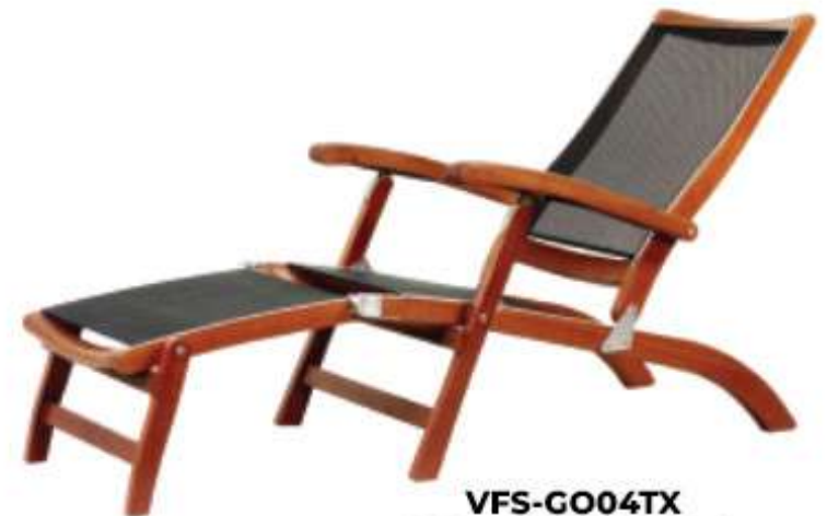
VFS-GO04TX 140 x 61 x 95H (Cm)