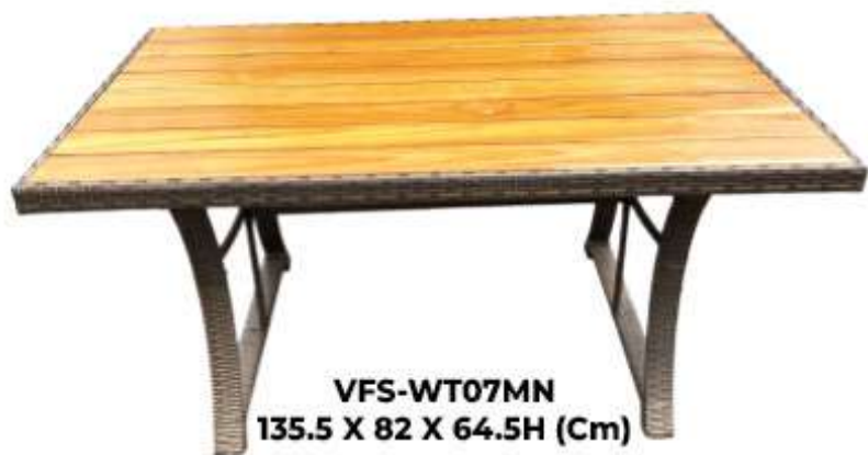
VFS-WT07MN 135.5 X 82 X 64.5H (Cm)