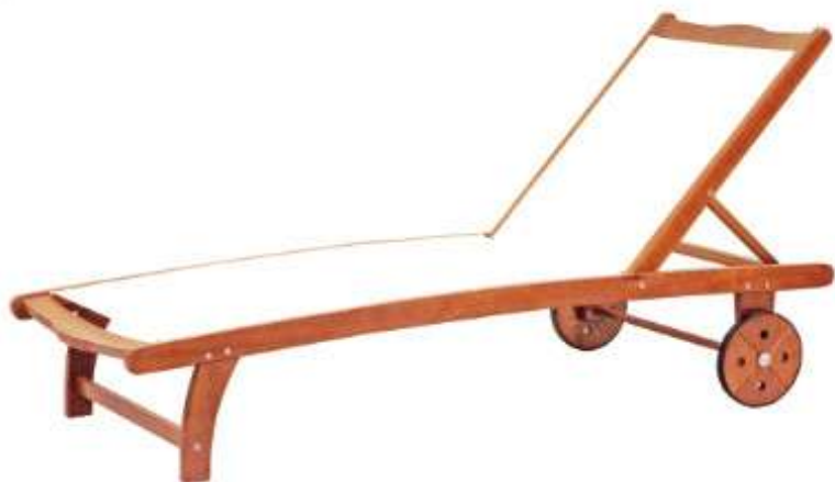
VFS-GO21TT 166 x 65 x 94H (Cm)