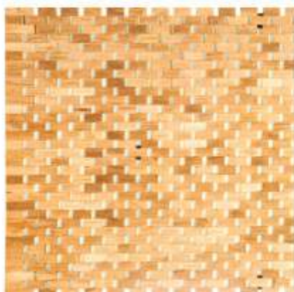
VFS-GO09BR 90 x 50 x 1.2H (Cm)