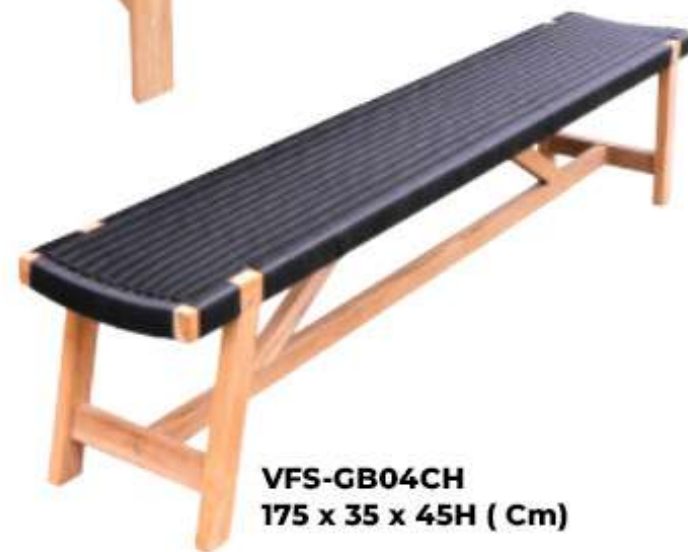
VFS-GB04CH 175 x 35 x 45H (Cm)