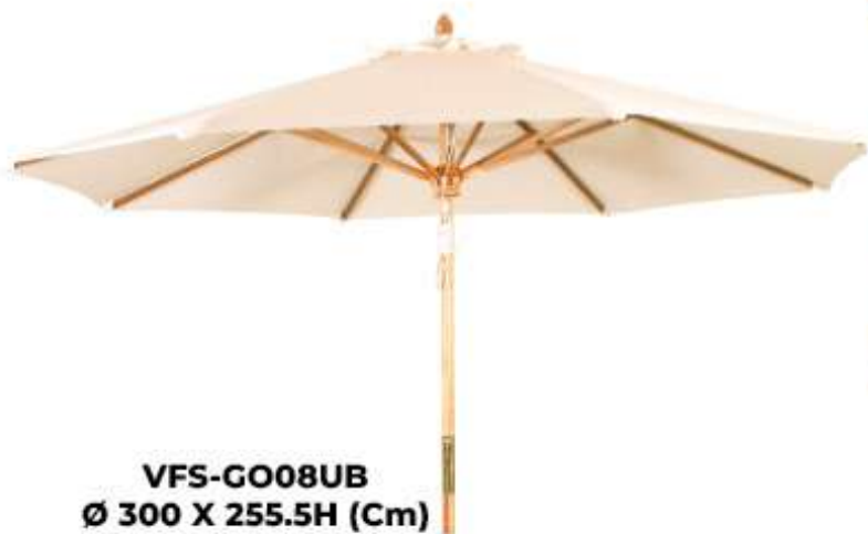
VFS-GO08UB Ø 300 X 255.5H (Cm)