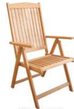
VFS-GC039 109 X 60 X 69H (Cm)