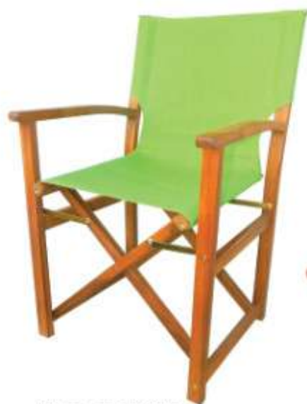
VFS-GO18HC 56 x 54 x 90H (Cm)