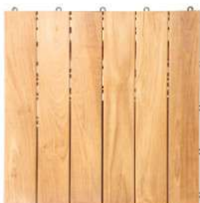
VFS-GO115H 30 x 30 x 2.5H (Cm)