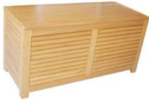
VFS-GO060 126x50x62H (Cm)