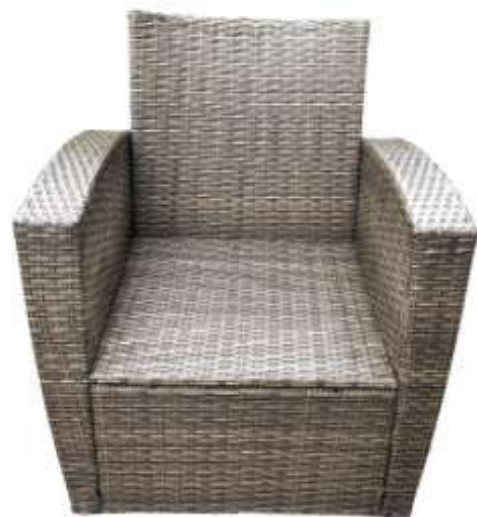
VFS-WB09MN 71.5 x 69 x 80H (Cm)