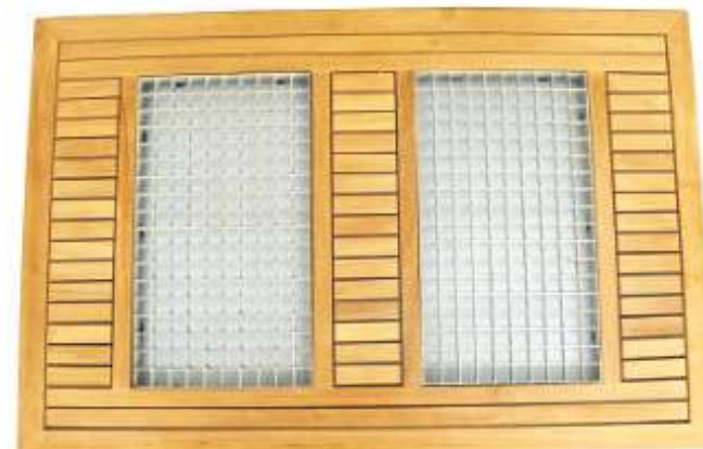
VFS-GO18BM 78.5 x 51.5 x 3.8H (Cm)