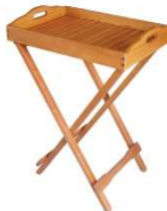
VFS-GO07PM 54 x 38 x 76H (Cm)