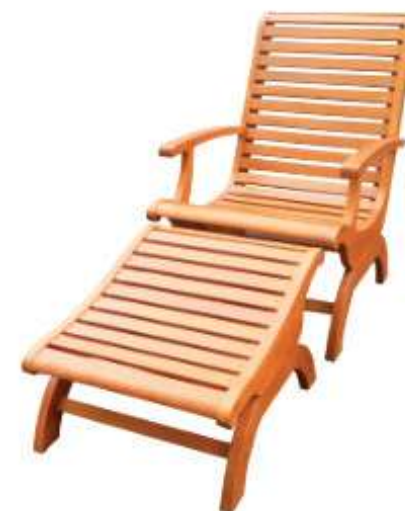
VFS-GC05IP & VFS-GC15IP 67 x 99 x 99H (Cm) 40.5 x 63.5 x 56H (Cm)