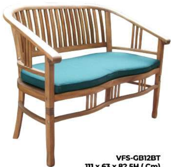
VFS-GB12BT 111 x 63 x 82.5H (Cm)