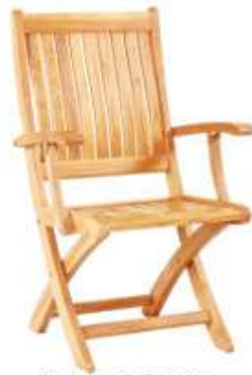
VFS-GC121R 61 x 58 x 97H (Cm)