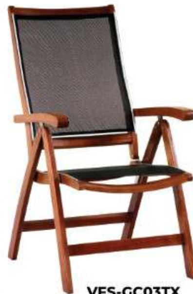
VFS-GC03TX 61 x 66 x 114H (Cm)