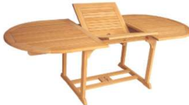
VFS-GT027G 230/170 x 100 x 74H (Cm)