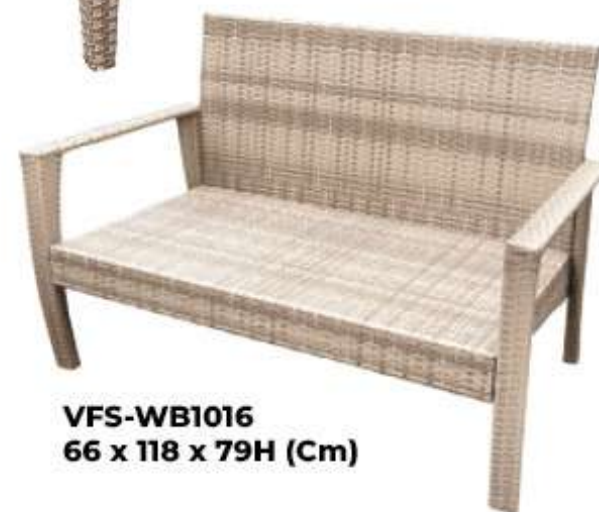
VFS-WB1016 66 x 118 x 79H (Cm)