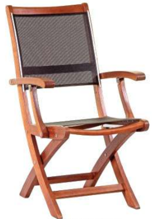
VFS-GC02TX 54 x 65 x 95H (Cm)