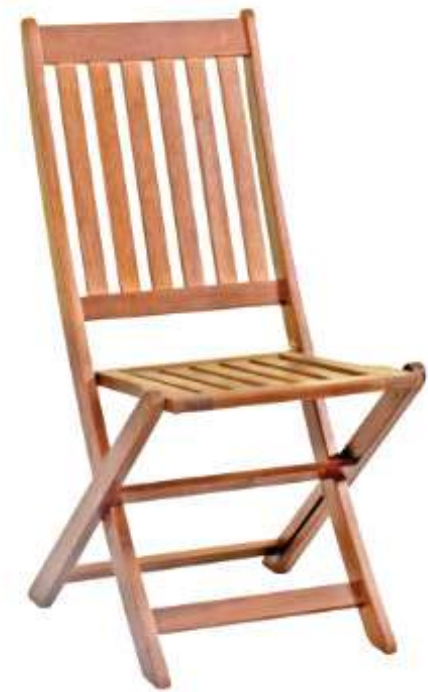
VFS-GC058 44.5 x 61 x 94H (Cm)