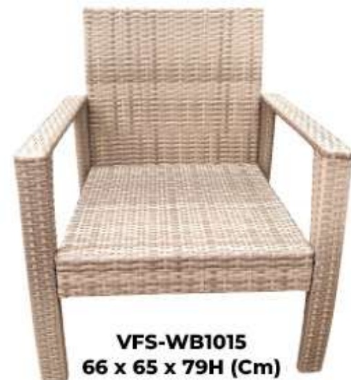
VFS-WB1015 66 x 65 x 79H (Cm)