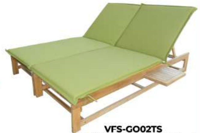
VFS-GO02TS 140/79.5 x 193.5 x 79H (Cm)