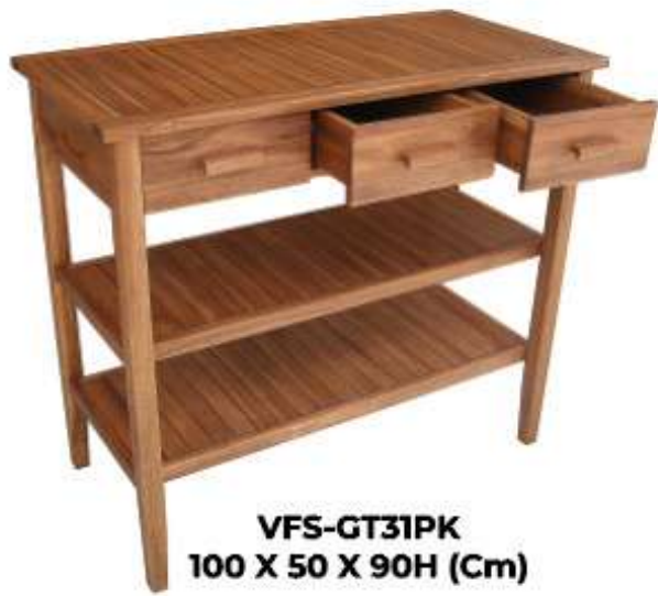
VFS-GT31PK 100 X 50 X 90H (Cm)