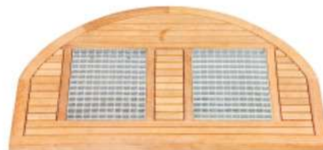
VFS-GO08BM 78.5 x 51.5 x 3.8H (Cm)