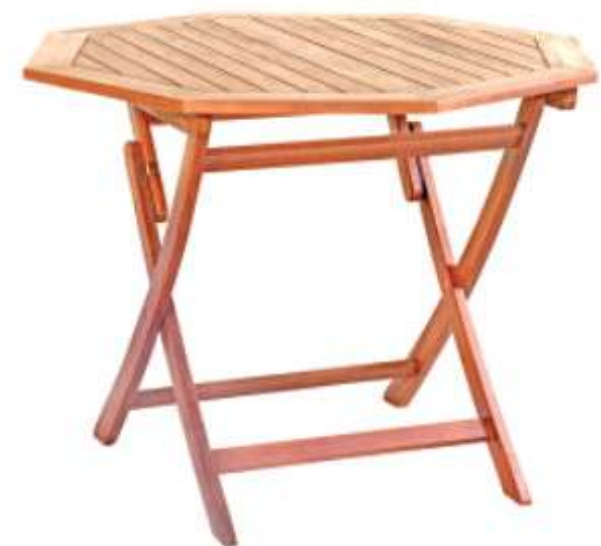
VFS-GT054 100 x 100 x 74H (Cm)