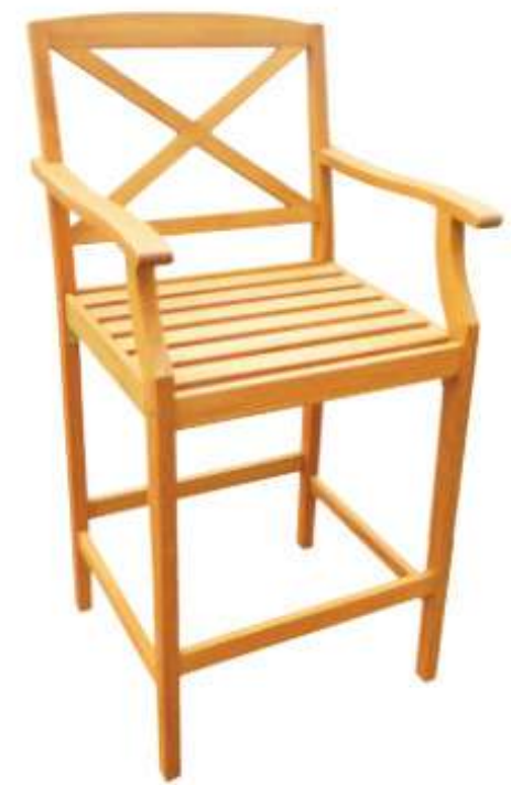
VFS-GB014H 58.5 x 61 x 118H (Cm)