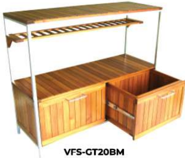
VFS-GT20BM 114 x 90 x 95H (Cm)