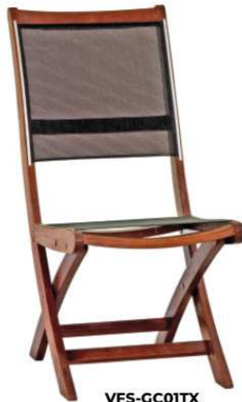
VFS-GC01TX 44 x 65 x 95H (Cm)