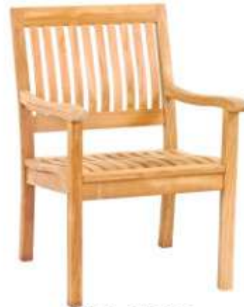
VFS-GB016 87 x 60 x 72H (Cm)