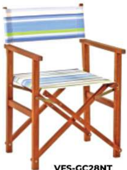
VFS-GC28NT 54 x 48 x 85H (Cm)