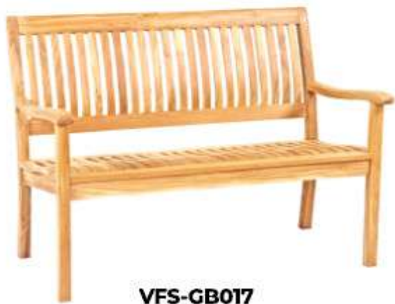
VFS-GB017 87 x 123 x 72H (Cm)