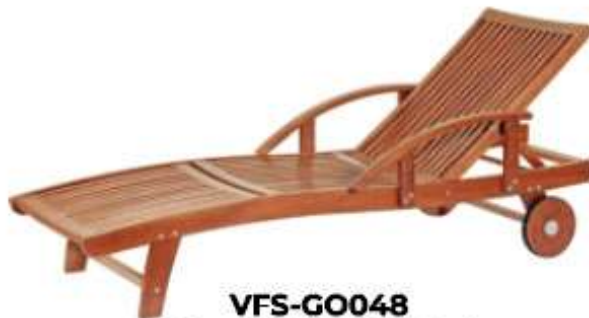
VFS-GO048 68 x 200 x 90H (Cm)