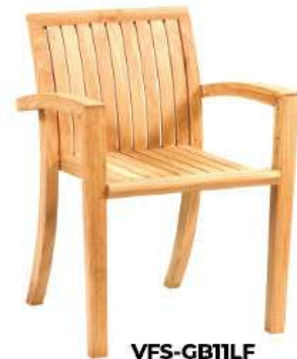
VFS-GB11LF 61 x 61 x 84H (Cm)