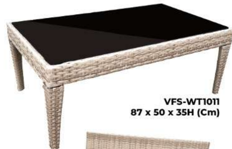
VFS-WT1011 87 x 50 x 35H (Cm)