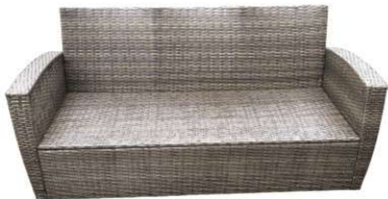
VFS-WB10MN 71.5 x 165.5 x 80H (Cm)