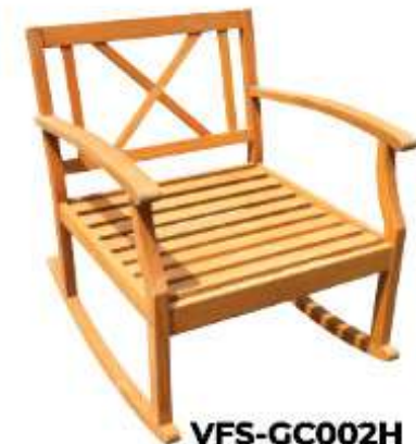
VFS-GC002H 89 x 71 x 84H (Cm)