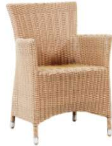
64 x 69 x 92.5H (Cm)