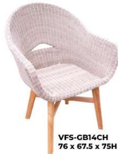
VFS-GB14CH 76 x 67.5 x 75H (Cm)