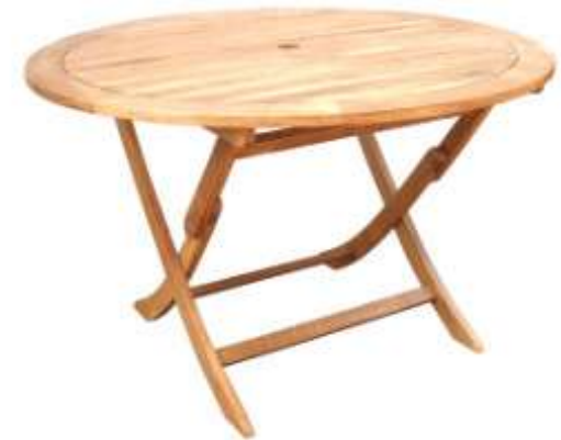
VFS-GT06DV & VFS-GT005 Ø 120 x 74H (Cm)