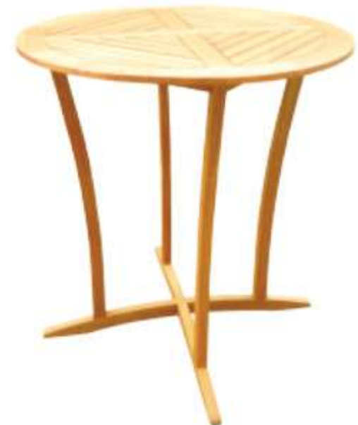
VFS-GT001H 99 x 99 x 104H (Cm)